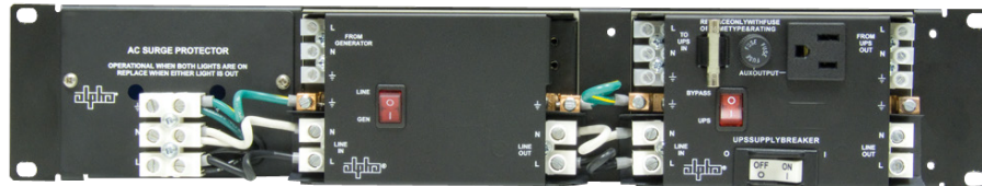
Universal Automatic Transfer Switch (UATS-far right) and Universal Generator Transfer Switch (UGTS-center) shown with surge protection (TVSS-left) in a 19" rack mount bracket (23" rack mount bracket also available).

CAN/CSA C22.2 No.107.3-05 UL1778 4th Edition Uninterruptible power systems CE: As component type for FXM UPS family and Micro UPS family (when enclosed in a box) EMC: Not applicable